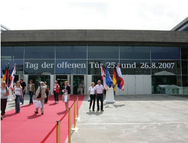
Tag der offenen Tür in Berlin.

During my stay in Berlin I participated in New York Festival at " Haus der Kulturen der Welt " in presence of the German Foreign Minister Mr. Frank Walter Steinmeier and I was very happy to visit some German Ministries and German Chancellery on the day of " Tag der offenen Tür " on 25. and 26. August.