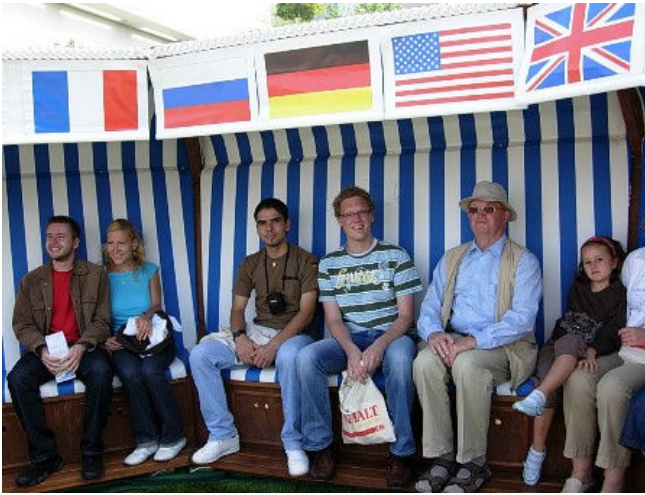
Beach chair at German Chancellery on Tag der offenen Tür .

I would like to close this report with one of my personal impressions of Berlin here: Since I play football in Kabul, I was very interested and eager to lively attend one of the football matches of Bundesliga . Fortunately I managed to attend the match between Hertha Berlin and Borussia Dortmund in the Olympia stadium in beautiful Berlin. It was my first time to watch live an international football match, and despite watching a lot of matches through the television screen back at home, but I really felt the lively atmosphere of being among such big gathering of fans and watching such a great game! It was amazing and I will never forget this experience! Finally won Hertha Berlin 3 – 2!