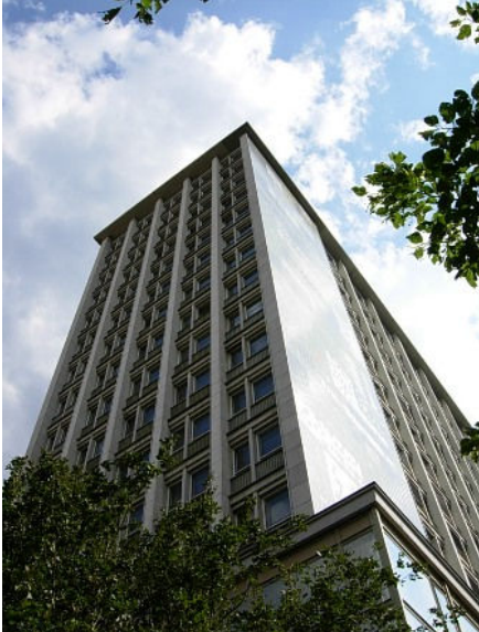
Senatsverwaltung für Stadtentwicklung.

Although this subject was not exactly matching to my study field, but I found it very interesting. During this time, I started to get familiar with a lot of issues such as urban reconstruction, urban development and construction management.