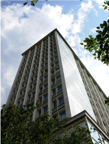
Senatsverwaltung für Stadtentwicklung.

Although this subject was not exactly matching to my study field, but I found it very interesting. During this time, I started to get familiar with a lot of issues such as urban reconstruction, urban development and construction management.