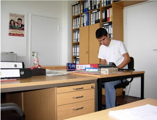
My workroom in Senatsverwaltung für Stadtentwicklung .