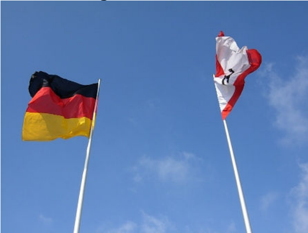
German Flag and Berlin State Flag.

As it was already planned for me to reside in the historic and beautiful city of Berlin, I always wished to visit all historic places, monuments and beautiful sights of this marvellous city.